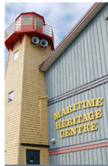
Exhibit Hours: Monday - Friday 10:00 a.m - 4:00 p.m

Business Hours: Monday - Friday 9:00 a.m - 5:00 p.m